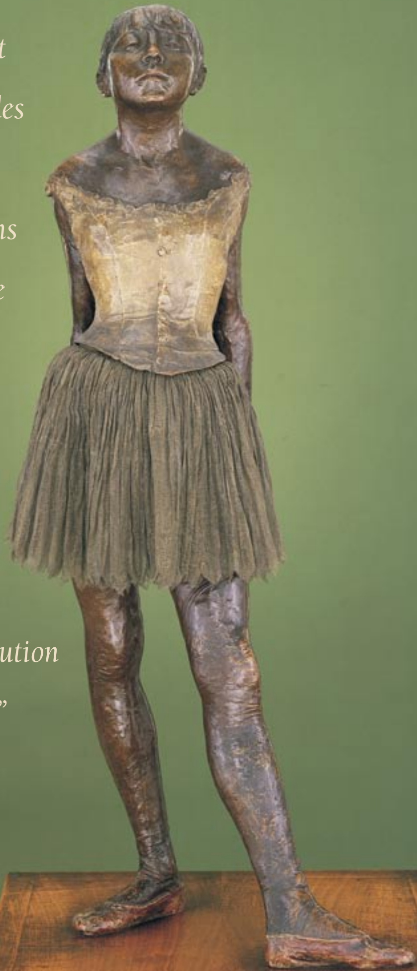
Little Dancer of Fourteen Years Edgar Degas Philadelphia Museum of Art

“The Delphi Project Foundation provides innovative arts education programs that not only serve an important cultural purpose but more importantly, they provide an invaluable contribution to the community.”